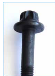
Bolt with flange in its head

On the other hand, some bolts, instead of the washer, include a "flange" together with the head that has the same function