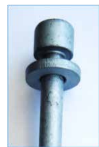
Bolt with washer under the head